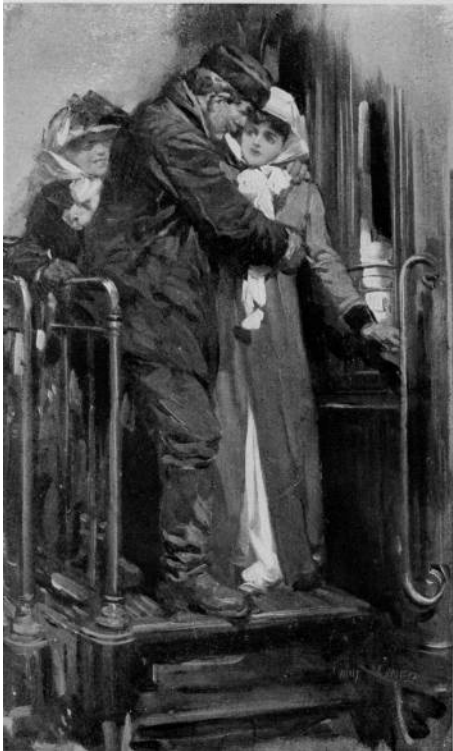
"SHE WAS CONSCIOUS OF A CERTAIN SHRINKING FROM HIS EMBRACE" Page 107