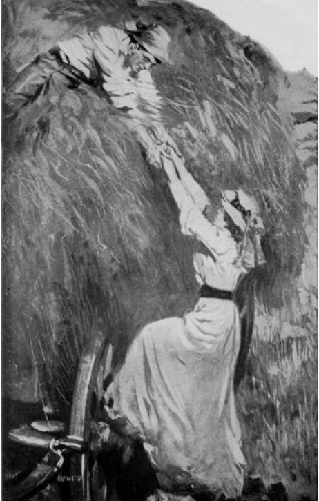
"THE NEXT MOMENT SHE WAS LIFTED UPWARDS" Page 146

"Now," he announced, "I guess you'll find that a snug enough nest."